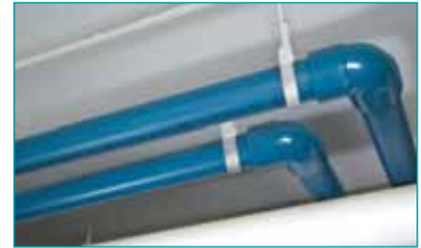
AquaRise is ideally suited for hot and cold water distribution through mains, laterals and risers.

Proven strength, competitive price, easy installation — what all this adds up to is significant time and cost-savings for contractors and building owners over the long term.