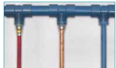
Transition fittings enable easy connections to other materials for greater job-site flexibility.

AquaRise interior & exterior walls remain smooth in any service condition, unlike metal which, over time, will rust, pit, scale & corrode.