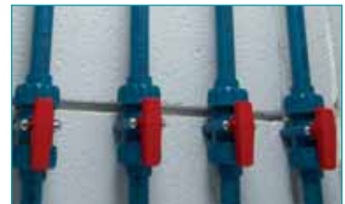
AquaRise is also ideal for smaller diameter plumbing applications including laterals, distribution lines and branch lines.