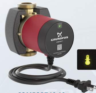
COMFORT 10-16 Temperature

The intelligent AUTOADAPT function learns the hot water consumption patterns of the homeowner and adapts the operation time accordingly. Automatic vacation mode is activated if no water is tapped in a 24-hour period. Ideal for energy-conscious households with regular hot water usage. This control mode reduces energy consumption by 67% compared to continuous operation.