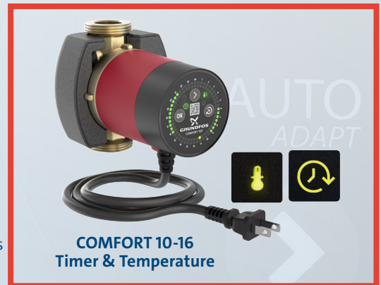
COMFORT 10-16 Timer & Temperature