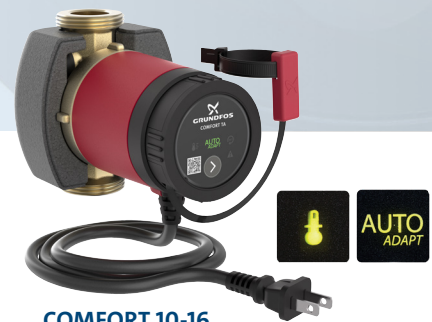
COMFORT 10-16 AUTOADAPT & Temperature