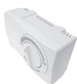
GF-MHX3 Manual Humidistat