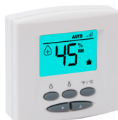
GF-X4 Automatic Humidistat