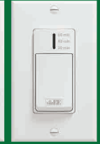
20-40-60 Control 41300