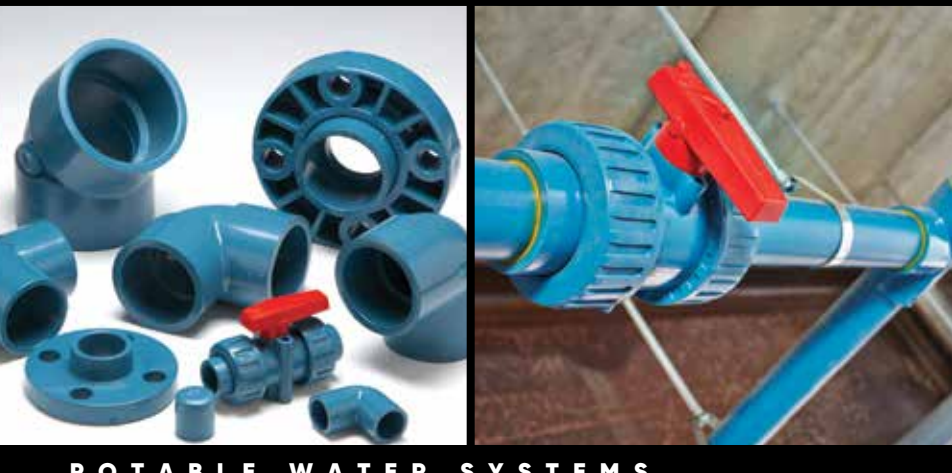
POTABLE WATER SYSTEMS