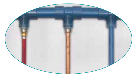
Transition fittings enable easy connections to other materials for greater job-site flexibility.