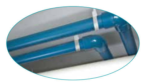
AquaRise is ideally suited for hot and cold potable water distribution through mains, laterals and risers.

Proven strength, competitive price, easy installation – what all this adds up to is significant time and cost-savings for contractors and building owners over the long term.