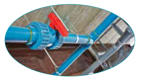
AquaRise is also ideal for smaller diameter plumbing applications including laterals, distribution lines and branch lines.